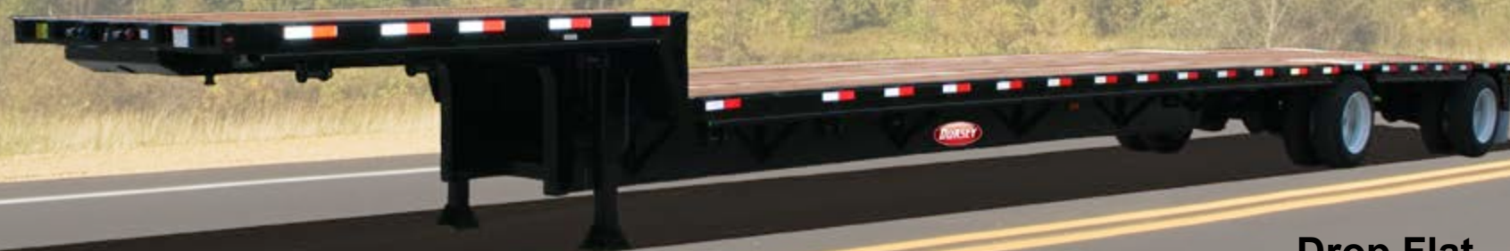
Drop Flat 48'